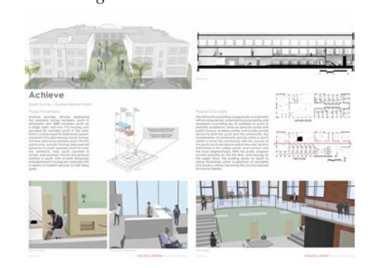
Noah Suchy & Audrey Kleinschmidt, Fall, 2020